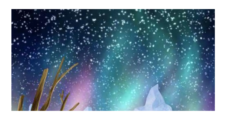
Fathom Publishing Company • www.fathompublishing.com